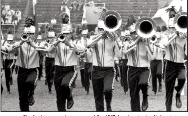
The Appleknockers junior corps at the 1967 American Legion Nationals in Boston, MA.

He is a physician in Elmira, NY, who still plays trumpet and now bugle with St. Joseph's Alumni Corps of LeRoy, NY.